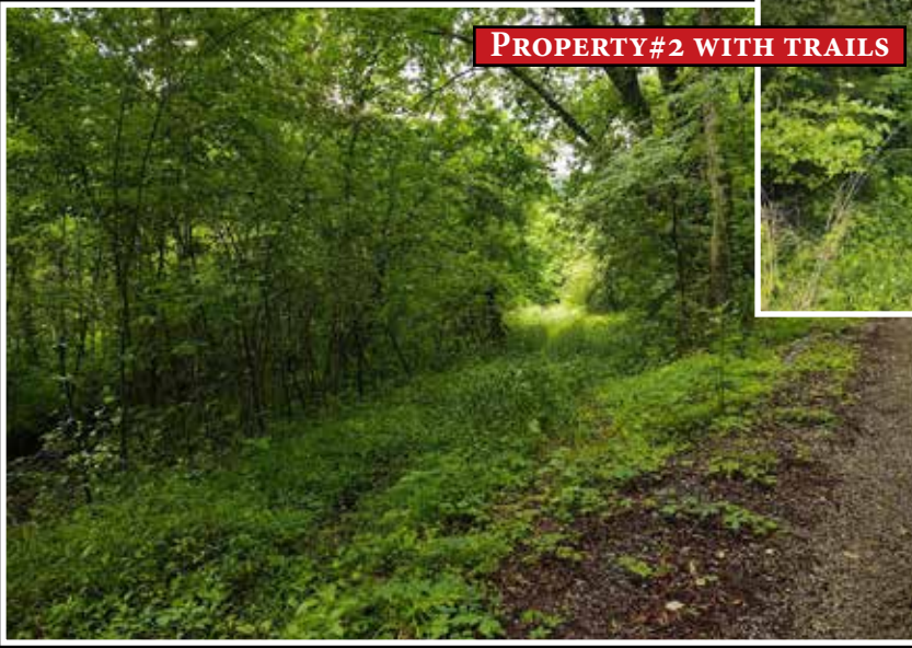
PROPERTY #2 WITH TRAILS

TWO GREAT PROPERTIES SELLING IN ONE AUCTION Saturday, June 20th, 2020 @ 10:00 A.M.