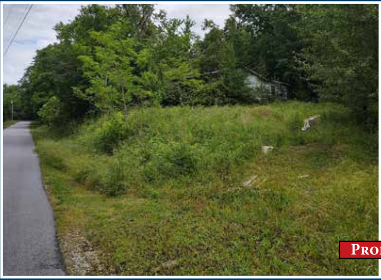
PROPERTY #1 WITH LAKE VIEW

SALE OF BOTH PROPERTIES WILL TAKE PLACE AT 156 SULLIVAN BEND