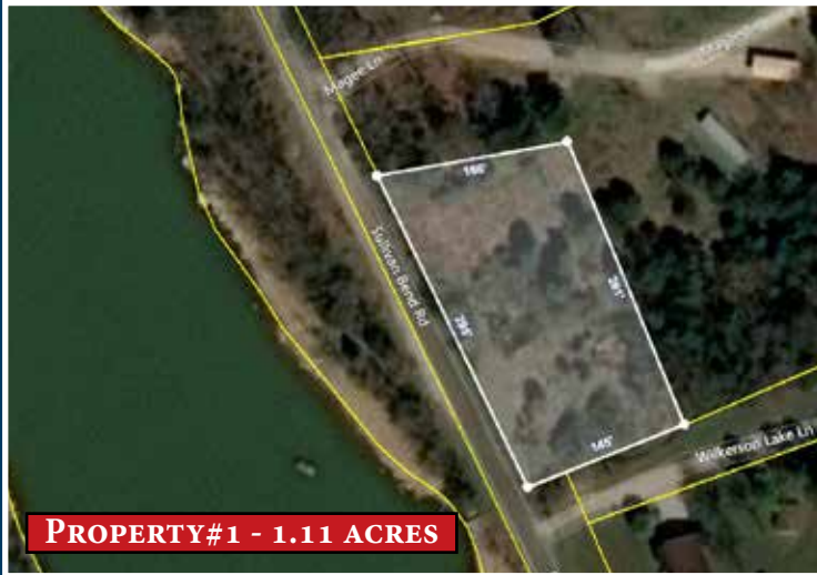
PROPERTY#1 - 1.11 ACRES