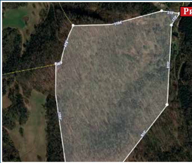
PROPERTY#2 - 50.75 ACRES

156 SULLIVAN BEND • 1.11 ACRES • AWESOME VIEW OF THE LAKE