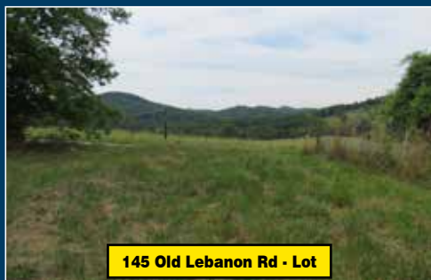
145 Old Lebanon Rd - Lot