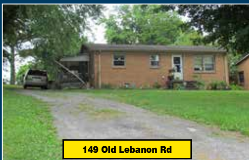
149 Old Lebanon Rd

Selling 4 homes and one vacant building lot. These are all located on the same side of the road, side by side. Great investment opportunity located 3 miles from Walmart and 2 miles from the square in Carthage. All of these properties front Old Lebanon Rd and McCall Street.