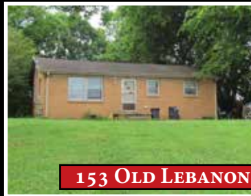
153 OLD LEBANON RD