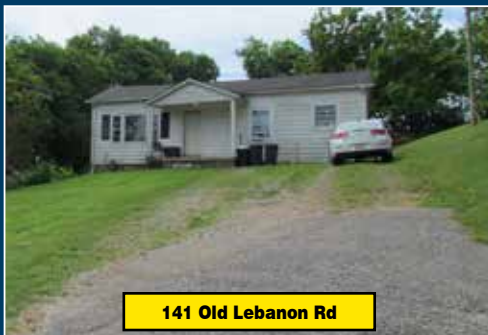
141 Old Lebanon Rd