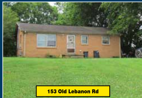
153 Old Lebanon Rd