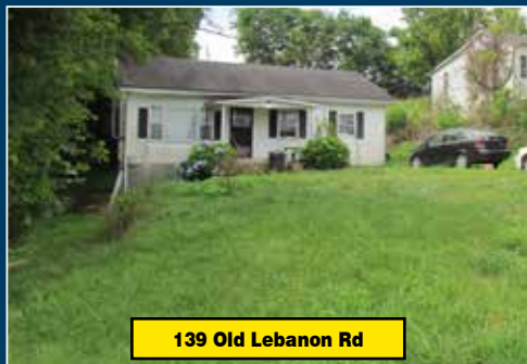
139 Old Lebanon Rd

139, 141, 145, 149 & 153 Old Lebanon Rd, Carthage, TN 37030