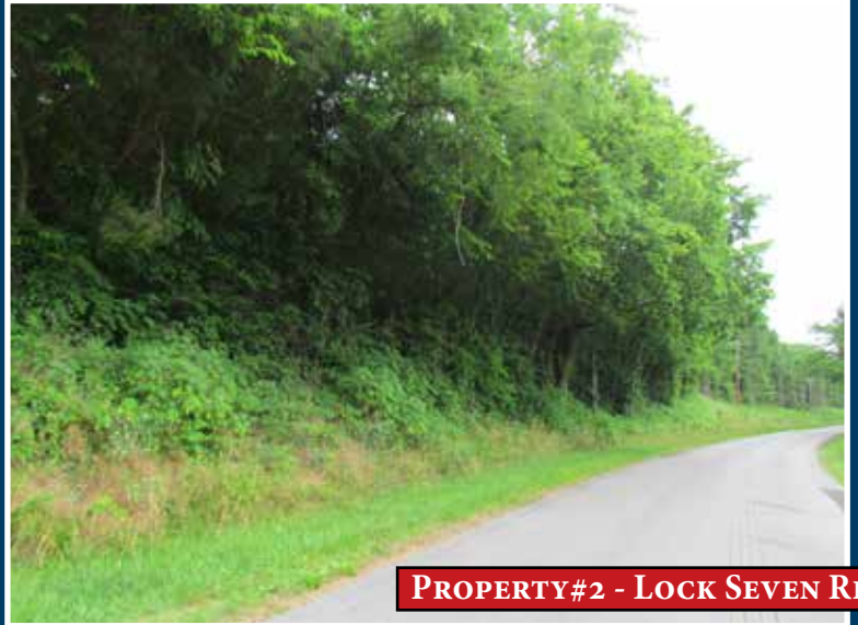
PROPERTY#2 - LOCK SEVEN RD

136 County House Circle is a brick, site-built home sitting on .68 acre lot. Mature shade trees on level lot with large backyard. The 17 acres on Lock Seven Rd has approximately 1,900 feet of road frontage. Mostly wooded land.