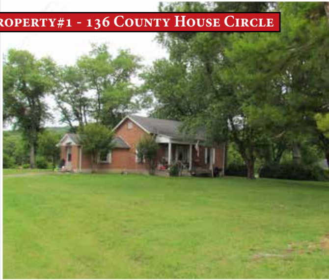
PROPERTY#1 - 136 COUNTY HOUSE CIRCLE