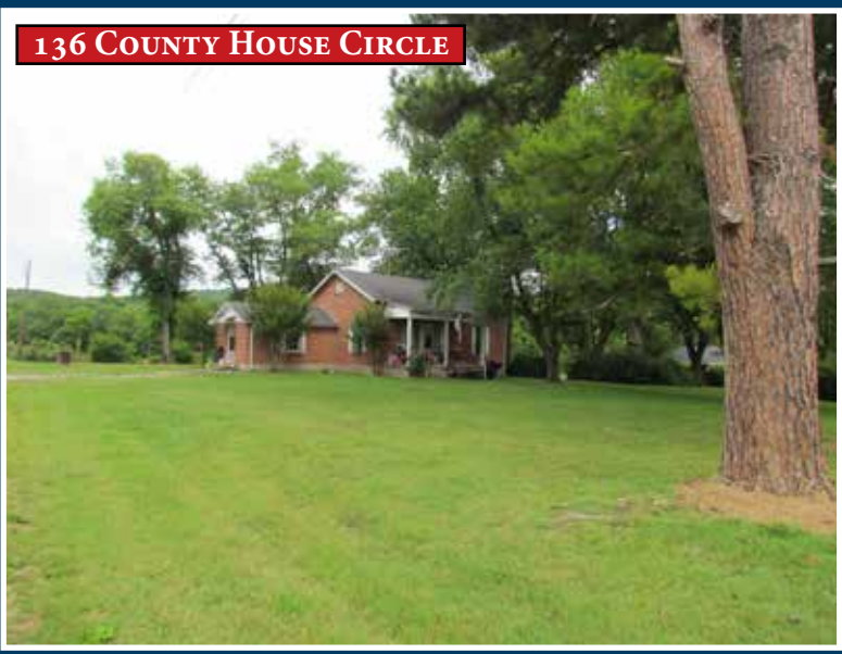
136 COUNTY HOUSE CIRCLE

BRICK HOME ON .68 ACRES & 17 ACRE LOT W/APPROX. 1,900 FT OF ROAD FRONTAGE