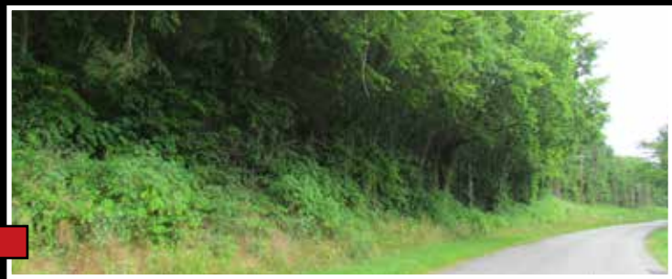
LOCK SEVEN RD

BRICK HOME ON .68 ACRES & 17 ACRE LOT W/APPROX. 1,900 FT OF ROAD FRONTAGE