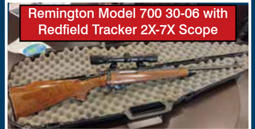
Remington Model 700 30-06 with Redfield Tracker 2X-7X Scope

DIRECTIONS: From Nashville take I-40 East to exit 239B (Lebanon). Go 2.2 miles to right on Hartsville Pike. Go half mile and turn left on E Forrest Ave. Go 250 feet to right on Nixon Dr. Then 800 feet to property on right.