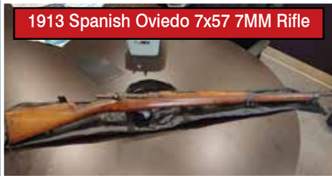
1913 Spanish Oviedo 7x57 7MM Rifle