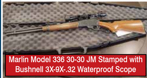
Marlin Model 336 30-30 JM Stamped with Bushnell 3X-9X-.32 Waterproof Scope